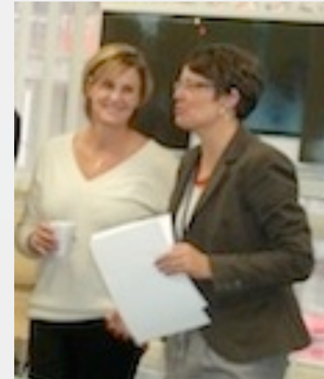
Top picture: University of Adelaide students with consumer Jack.